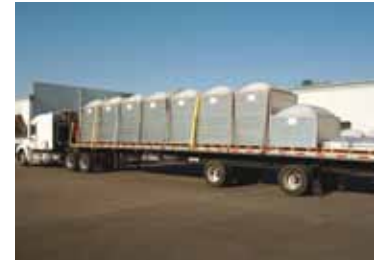
The skylights on this truck represent the equivalent of 240 kW of power plant output.