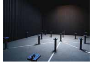
Sunoptics Photometric Test Lab

Outside of the United States, Sunoptics distributes to Mexico, Central America, South America, Europe, Africa, Australia, New Zealand, Turkey, Hungary, Poland, Sri Lanka, India, Malaysia, Indonesia, and wherever in the world the sun shines.