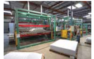
Thermal forming Sunoptics' high-performance prismatics.